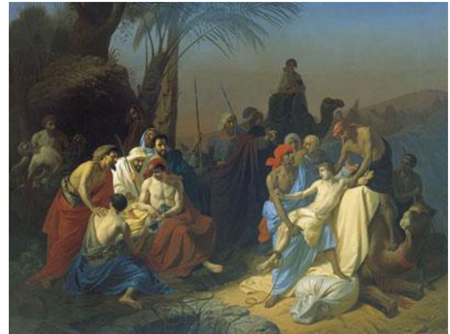
Joseph Sold Into Slavery