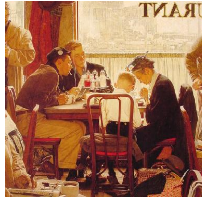
“Saying Grace” by Norman Rockwell, The Saturday Evening Post Cover - November 24, 1951

nician woman, social outcasts like the woman at Jacob's well, noblemen like Jairus, rulers like Nicodemus, blind beggars like Bartimaeus, and little children like those of whom He said, “Of such